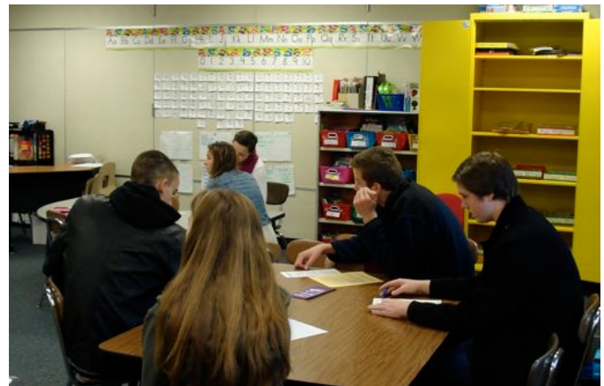
Northport Students Registering to Vote

The documents we created are now available at the County Clerk's Office to give to new voters.