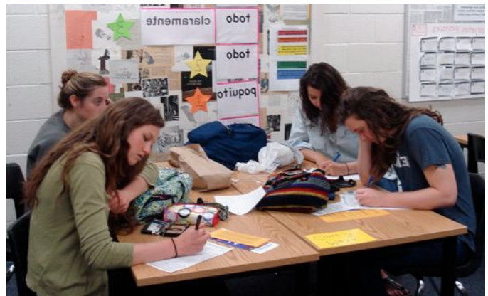
Leland Students Filling Out Forms